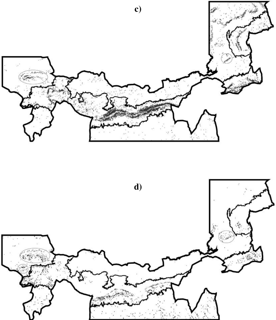
FIG. 2. (cont.)—[Mapas predictivos de probabilidad de aparición para los hábitats de nidificación del águila real (a), alimoche común (b), halcón peregrino (c) y búho real (d) en el área de estudio. Se indican áreas adyacentes a la ZEPA ES000246 con agregación de píxeles de alta probabilidad ( > 0,75 ).]